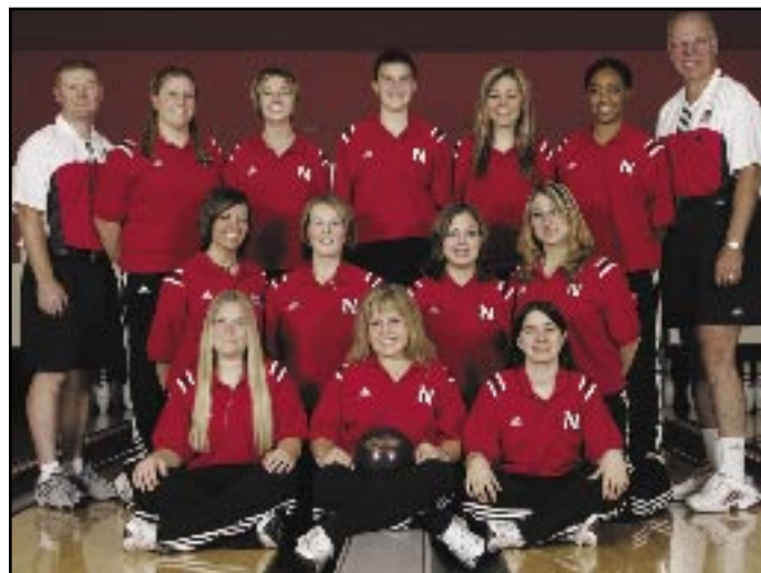
The Husker women's bowling team posted its sixth national title and the first as the sport became an official NCAA-sanctioned sport.