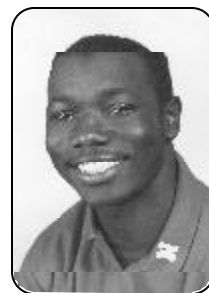
Tommie Frazier, QB Second, 1995